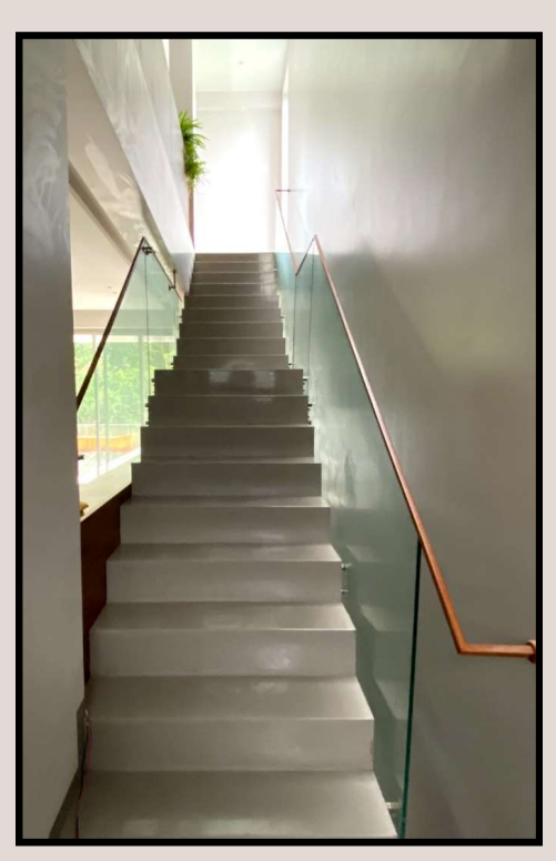
BUNGALOW , BHUGAON