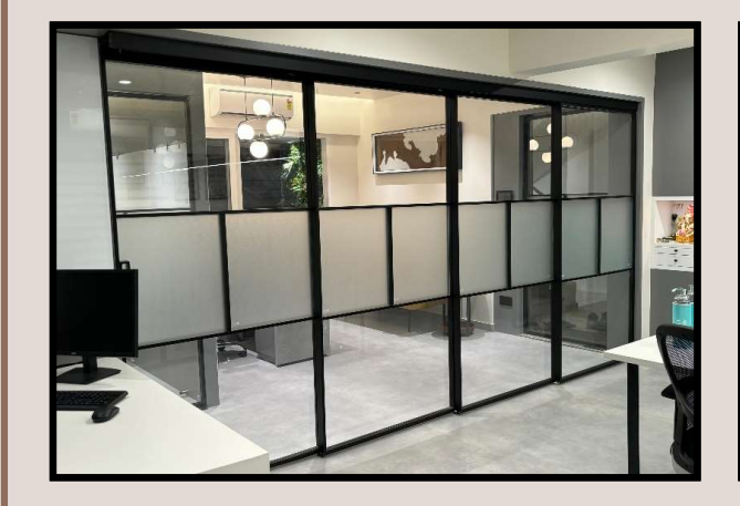
OFFICE , MODEL COLONY