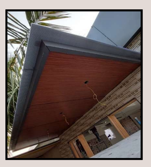
SHREE VITTHAL HOTEL, KALABURGI