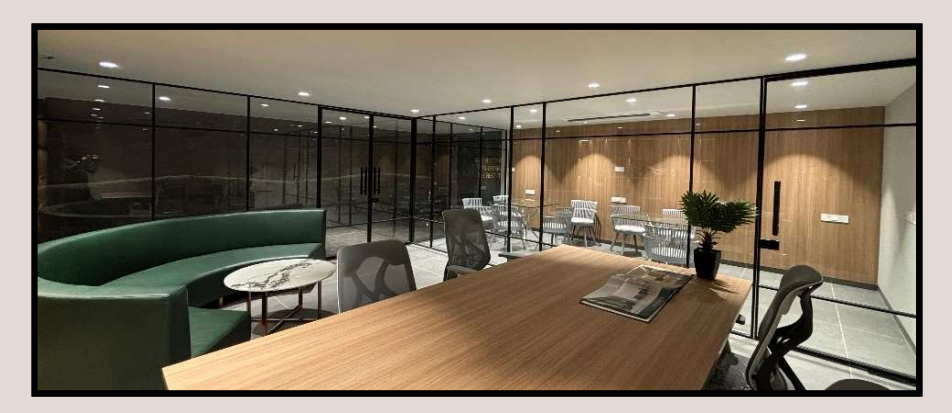
OFFICE , PASHAN