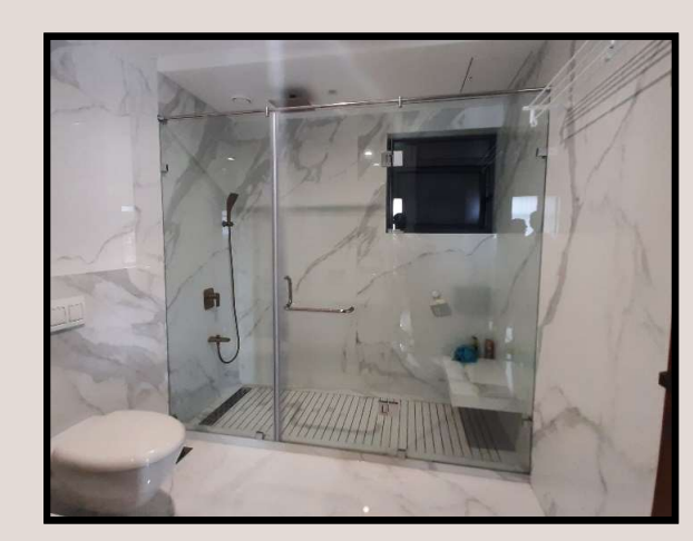
PARK LANDMARK , KATRAJ

Shower Cubicles are enclosed spaces designed specifically for bathing, providing privacy and a defined area for showers. They can feature sliding or hinged doors, as per the customer requirement.