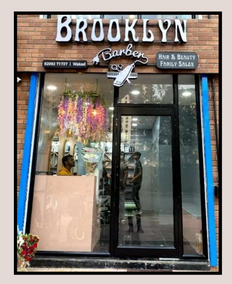
BROOKLYN SALON, WAKAD