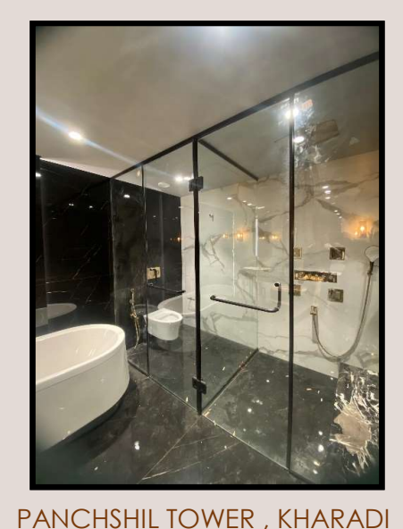
PANCHSHIL TOWER, KHARADI