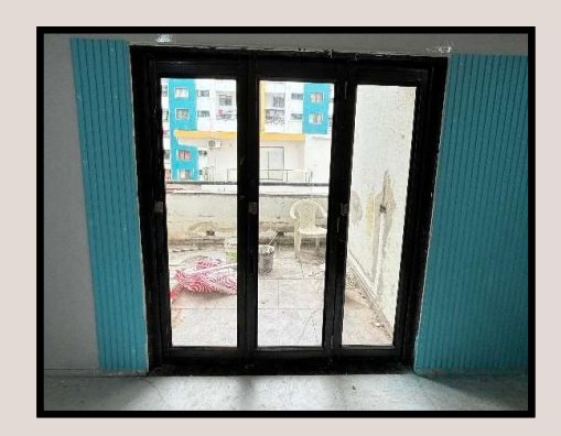
FLAT , KOTHRUD